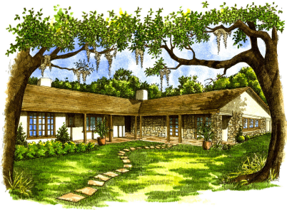
The Young Home

It was a signal milestone when, on September 30, 2009, Washington Oaks was added to the National Register of Historic Places. These sites tell the story of America. Here is a portion of our story: