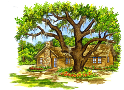
Restored office to Gift Shop

While many goals have been met, more can be accomplished: